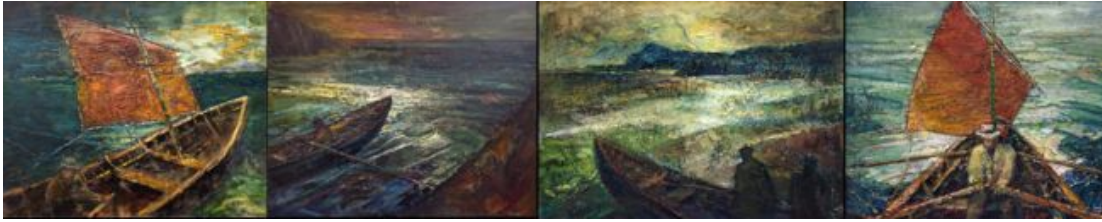
Paintings Courtesy of Liam Holden